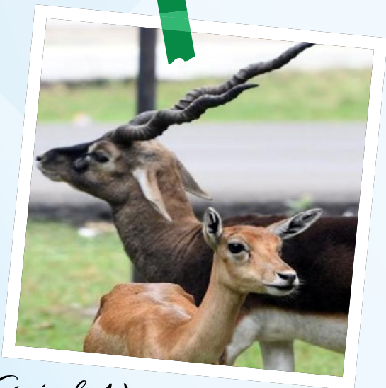
Guindy National Park