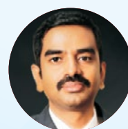
Dr Harsha Vardhan